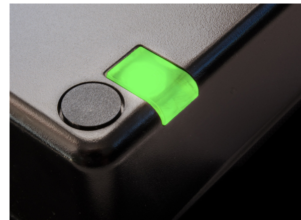
Integral Indicator LED