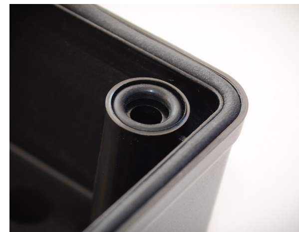
Optional IP65 Seal

/5A versions provide a 5A lamp changeover relay for use with higher powered lamp applications, such as high-bays. All other models incorporate a 2A lamp changeover relay.